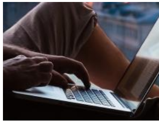
Priva Remote Management