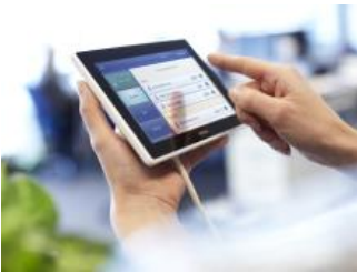
Priva Blue ID TouchPoint