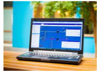
Priva TC Manager