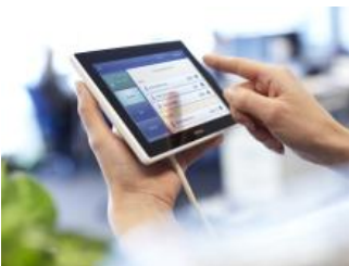
Priva Blue ID TouchPoint