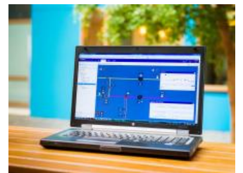
Priva TC Manager